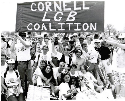
National March on Washington for LGB Rights.