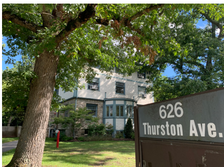
626 Thurston, home of the LGBT Resource Center